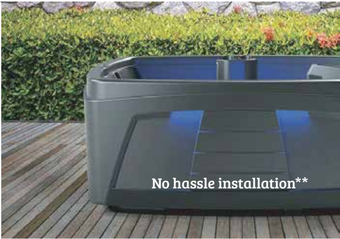
No hassle installation**