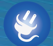
Plug 120V (convertible 240V)*