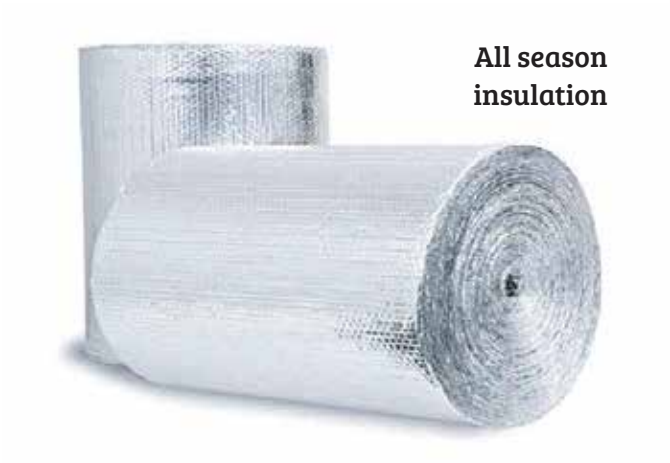
All season insulation