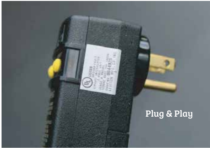
Plug & Play