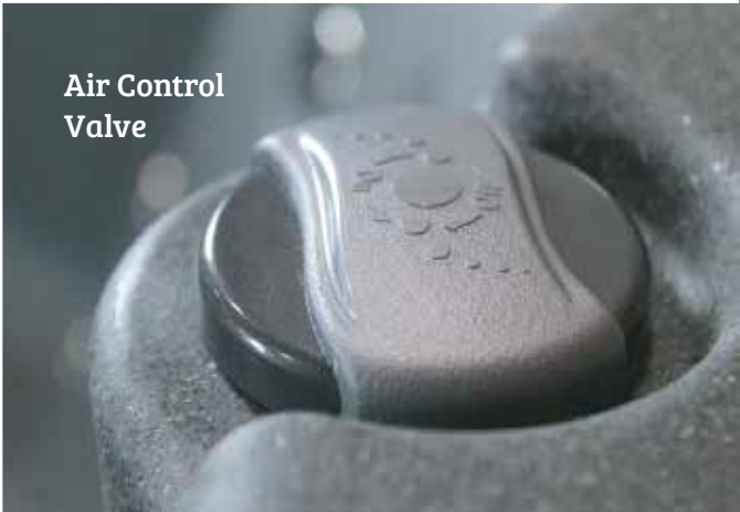
Air Control Valve